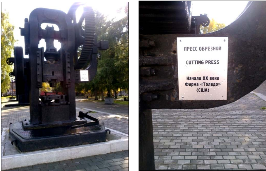
Fig. 4. A cutting press erected in the historical centre of Yekaterinburg

And what about the Russian frontier myth? Is there any special region which may correlate with the American Wild West frontier's generative power? The answer is not Ukraine, despite the above-described etymology of this term, which uses the "frontier" stem. The Russian frontier, the heart of Russian industry and economics, is located within the region of the Ural Mountains. The boundary between Europe and Asia runs along the eastern side of the Urals Mountains. It was in this area, specifically in the Nizhny