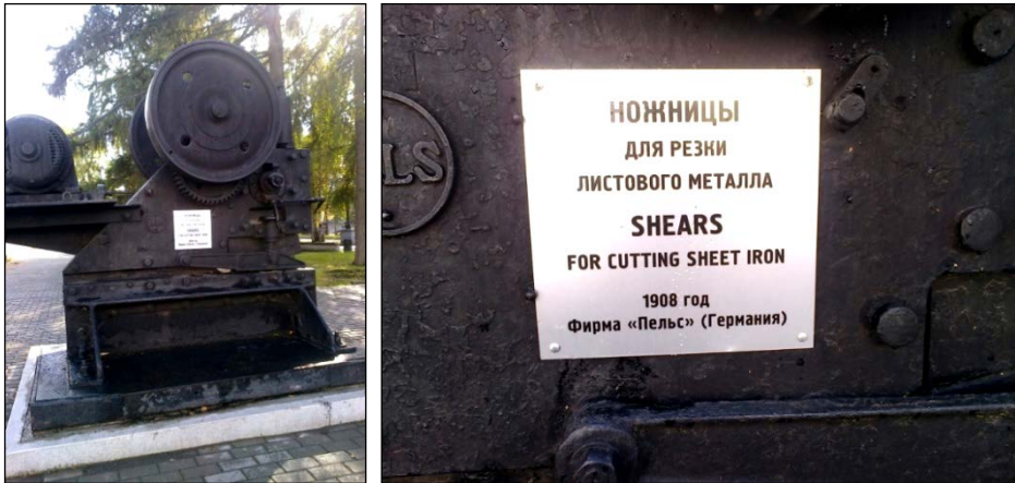
Fig. 3. Shears for cutting sheet iron erected in the historical centre of Yekaterinburg